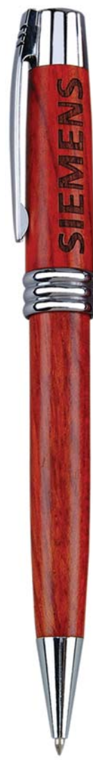
WB100 TWIST ACTION BALLPOINT W/ SHINY CHROME TRIMS