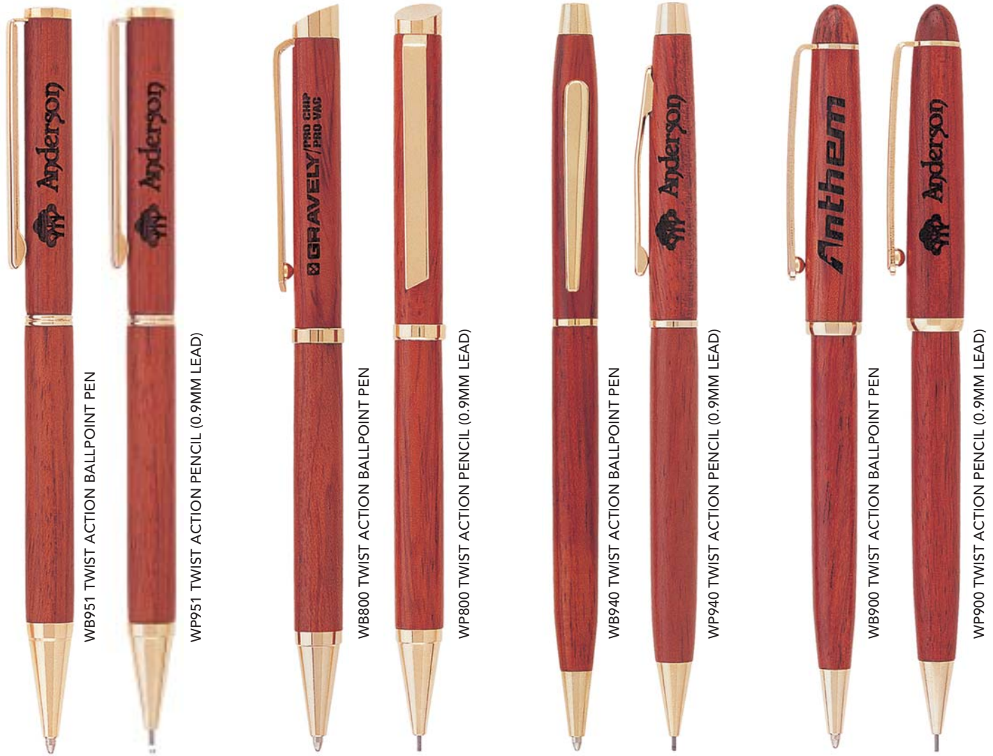
WB951 TWIST ACTION BALLPOINT PEN