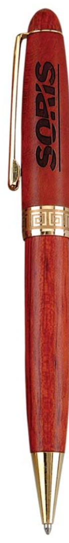
WB777 TWIST ACTION BALLPOINT