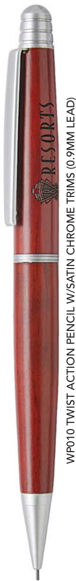
WP010 TWIST ACTION PENCIL W/ SATIN CHROME TRIMS (0.9MM LEAD)