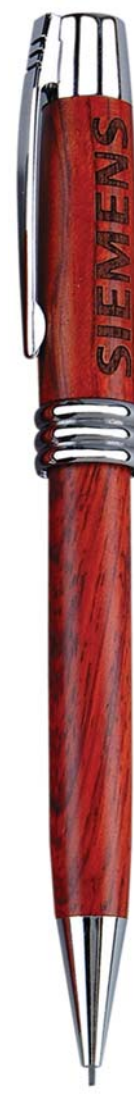
WP100 TWIST ACTION PENCIL W/ SHINY CHROME TRIMS (0.9MM LEAD)