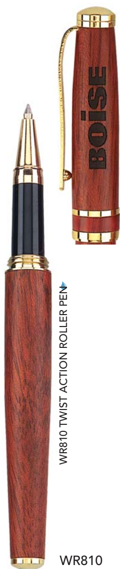
WR810 TWIST ACTION ROLLER PEN