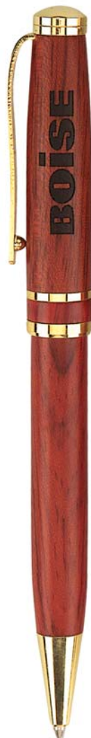
WB810 TWIST ACTION BALLPOINT W/ GOLD TRIMS