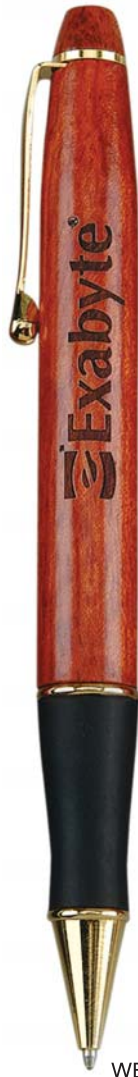
WB970 TWIST ACTION BALLPOINT PEN W/ RUBBER GRIP AND GOLD TRIMS