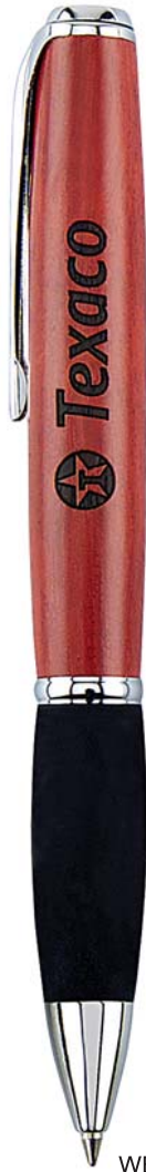
WB680 TWIST ACTION BALLPOINT PEN W/ SOFT RUBBER GRIP AND SHINY CHROME TRIMS