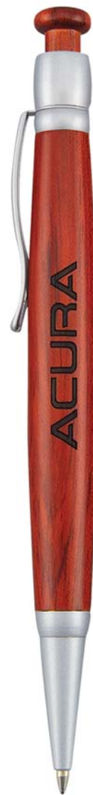
WB170 CLICK ACTION BALLPOINT PEN