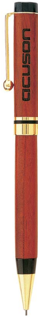
WP905 TWIST ACTION PENCIL W/ GOLD TRIMS (0.9MM LEAD)