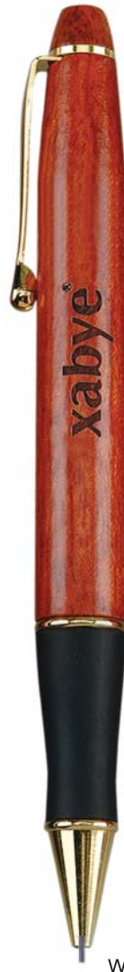
WP970 TWIST ACTION PENCIL W/ RUBBER GRIP AND GOLD TRIMS (0.9 MM LEAD)