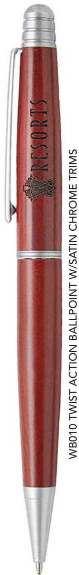
WB010 TWIST ACTION BALLPOINT W/ SATIN CHROME TRIMS