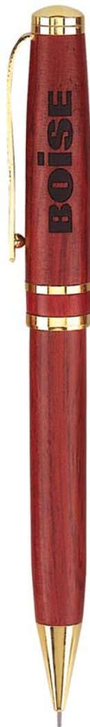
WP810 TWIST ACTION PENCIL (0.9MM LEAD)