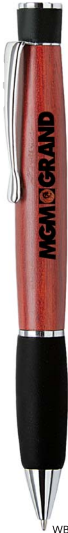
WB300 TWIST ACTION BALLPOINT PEN W/ SOFT RUBBER GRIP AND SHINY CHROME TRIMS