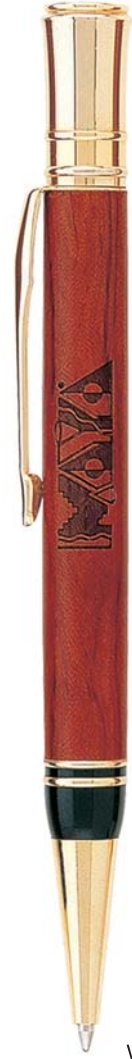
WB730 TWIST ACTION BALLPOINT PEN W/ GOLD TRIMS