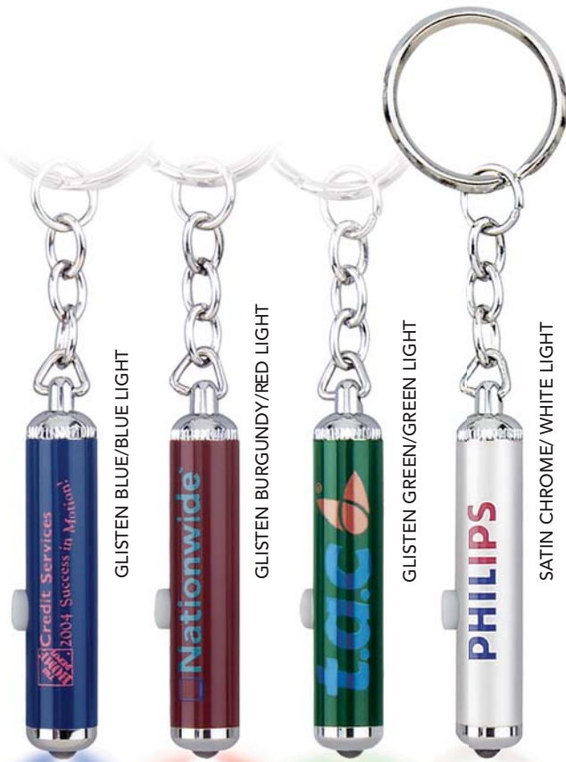
KT551 with Split-Ring Attachment