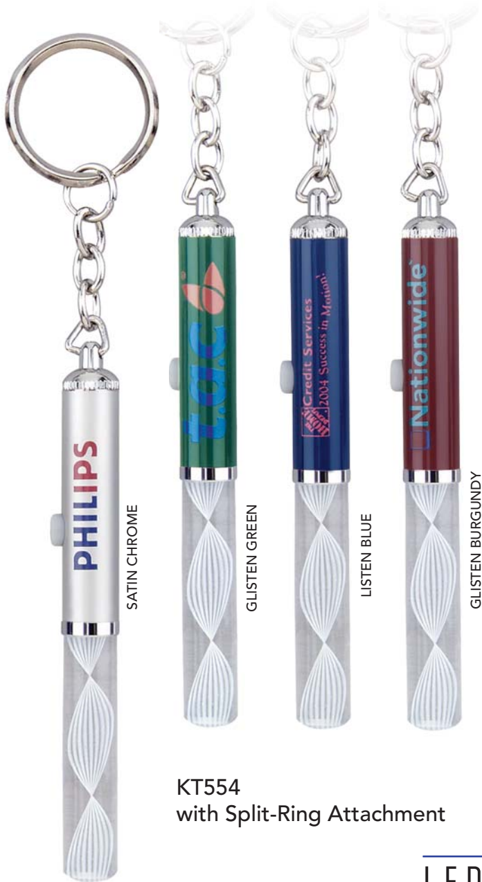
KT554 with Split-Ring Attachment