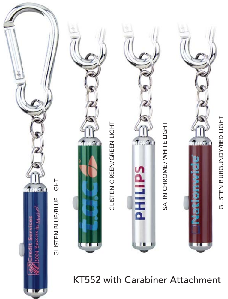
KT552 with Carabiner Attachment