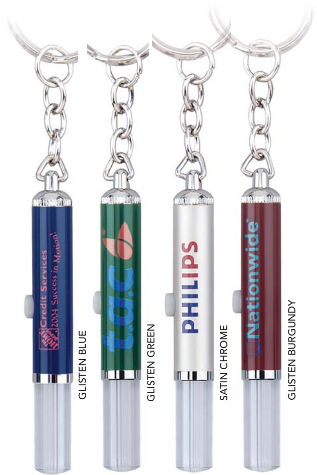
KT553 with Split-Ring Attachment